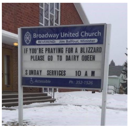
Wanting a blizzard?